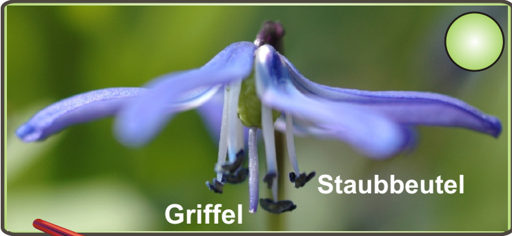
Scilla bifolia, Blaustern, Alpe Squill La Scille à deux Feuilles